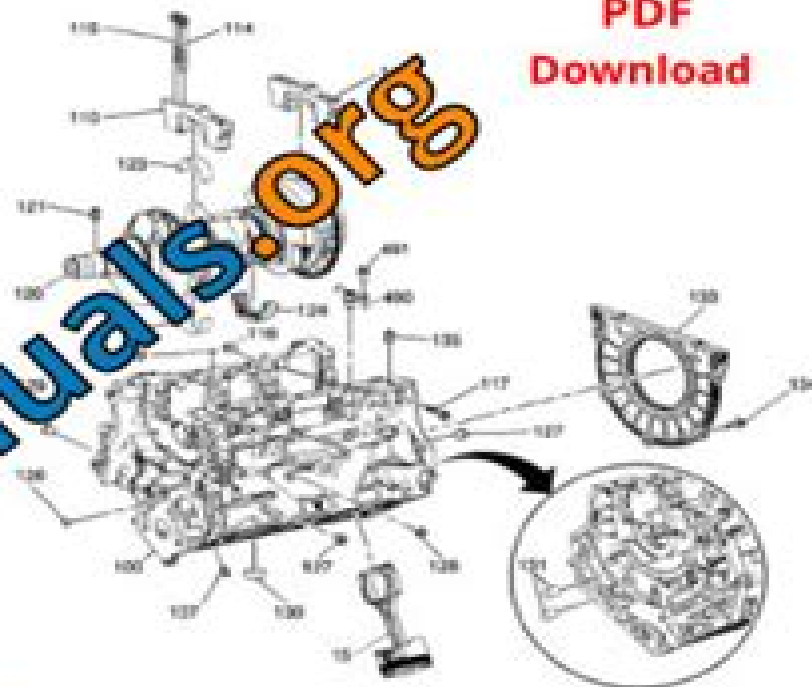
Engine Block Assembly

Remove the oil level indicator tube bracket.