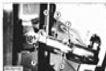
Tilt Cylinder Adjustment (1) Bolts (2) Bolt (3) Rod (4) Spacer (5) Pivot eye