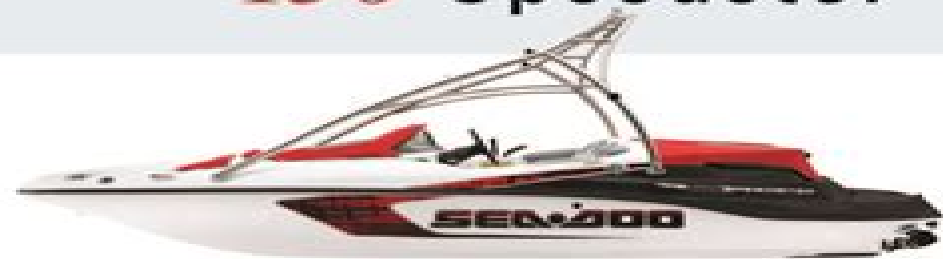
150 Speedster w/optional lower plate