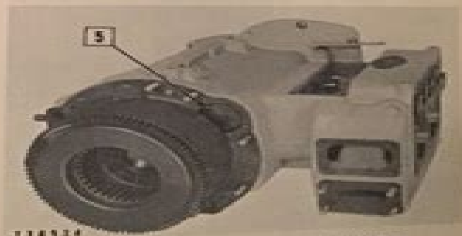
PREPARING TO REMOVE CAMSHAFT