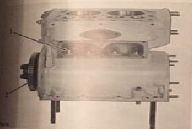
REMOVAL AT TIME OF RECONDITIONING 1-Camshaft gear, 2-Camshaft.

Remove the head. See the topic, CYLINDER HEAD REMOVAL AND INSTALLATION.