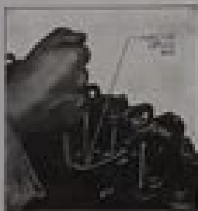
FIG. 1. \text{Pb}_2 = SUBSTITUTION AND TRANSITION