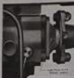
FIG. 20. A. CANTONMENT (PREF. 1900) (REAR) B. CANTONMENT (PREF. 1900) (FRONT)