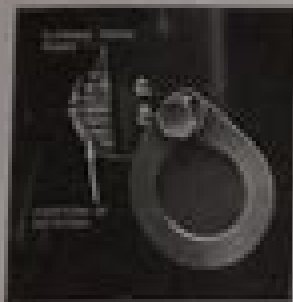
THE J. C. HARRIS FOUNDATION LITTLE ROCK, ARK.