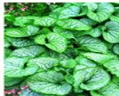
Siberian bugloss PAGE 53