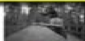
Our Neighbors in the Park

Printable AND Self-Grading Google Forms!