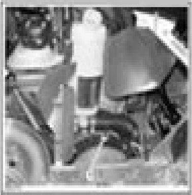
1. Connect fuel system to engine.

Unplug from the coolant reservoir the hose going to the engine.