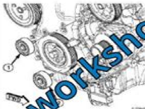
Fig. 67: Removing/Installing Accessory Drive Bolt Upper & Lower Idler.

Remove right engine mount bracket retaining bolts (4). Remove retaining nuts (2) and reposition mount bracket (1).