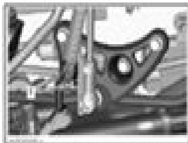
FIGURE 9 9. Detach gearlink vent hose from air filter housing