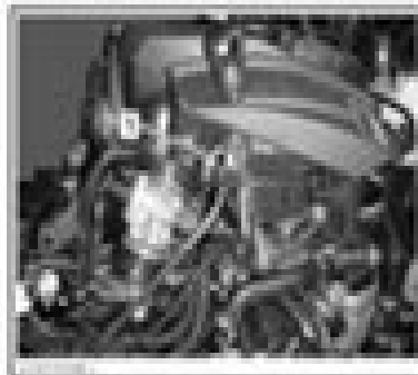
FIGURE 8 8. Carefully move link nut downward