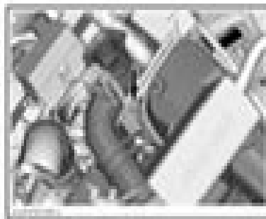
FIGURE 7 7. Remove air intake tube retaining screw