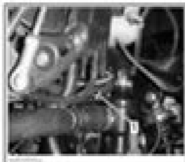
FIGURE 11 11. Detach gearlink vent hose from air filter housing