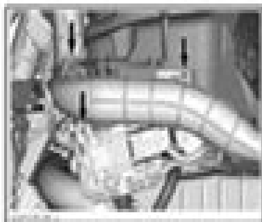
FIGURE 4 4. Remove ECM retaining screws