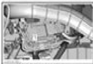
FIGURE 6 6. Remove air intake tube retaining screw