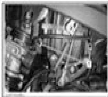
FIGURE 10 10. Detach gearlink vent hose from air filter housing