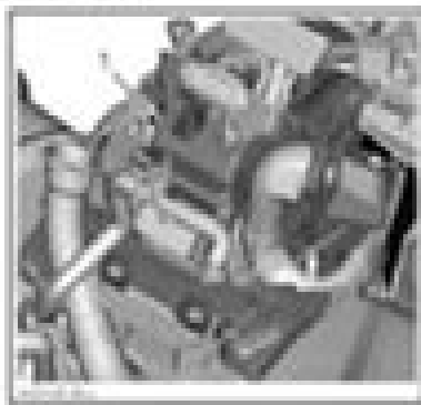
FIGURE 1 1. Dashboard support