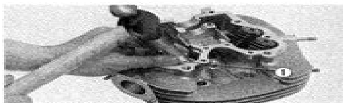
Fig. 1-9 ① Valve guide driver (07942-3290200)