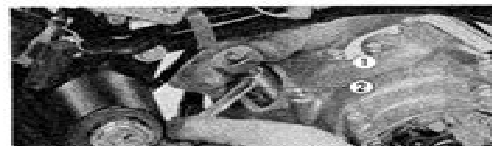
Fig. 1-12 ①, ② Tappet wrench (07908-3290000)