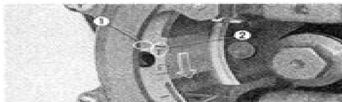
Fig. 1-11 ① Index mark ② "T" mark