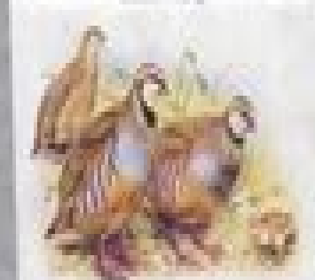
Common Partridge, and other game birds.