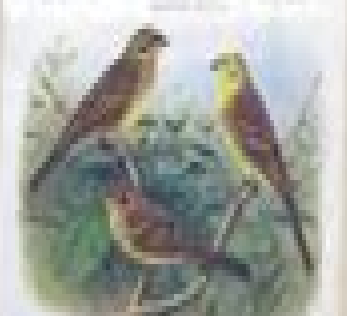
Common Sparrow, and other birds.