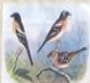
Common Sparrow, and other birds.