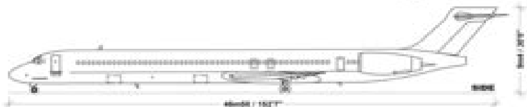
McDonnell Douglas MD90