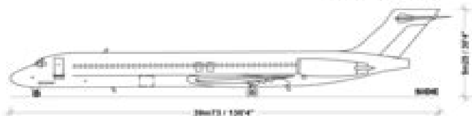
McDonnell Douglas MD87