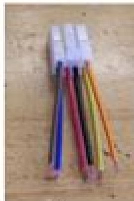
Connector 3 LINE OUTPUT CONVERTER CONNECTOR