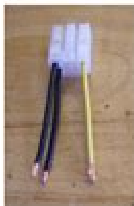
Connector 1 OPTIONAL DEM WOOFERS INPUT CONNECTOR

Female 8-WIRE connector REAR VIEW/ WIRES SIDE