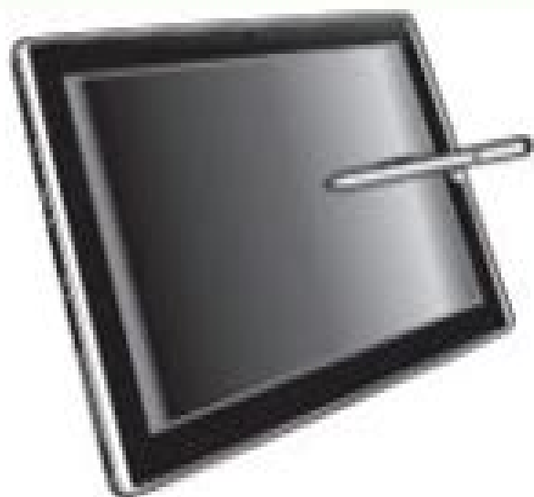
Eee Slate and Digitizer Pen