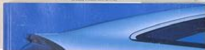
E-Class Sports Coupe Operator's Manual