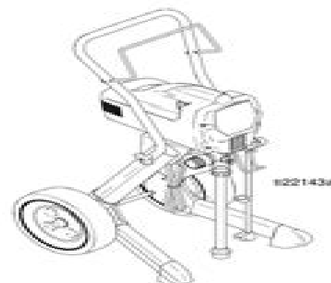
Magnum ProX9 Model: 16W123 Series A