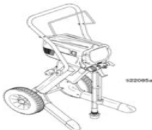
Magnum X7 Model: 16J751 Series B